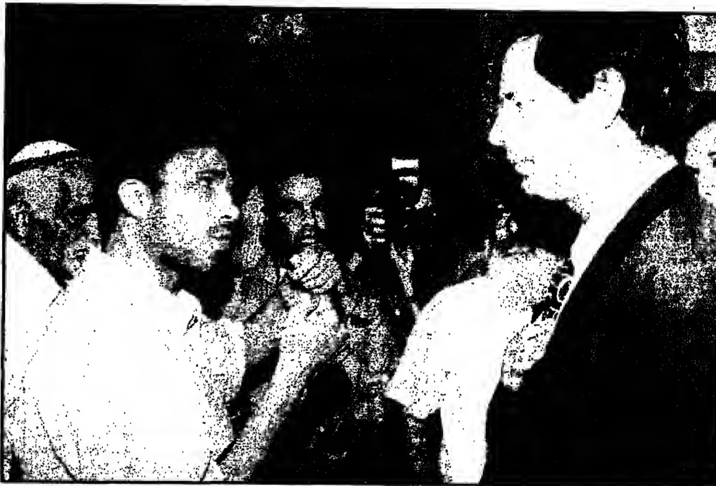
Labor MK Ophir Pines (right) argues with a Shas supporter at the Supreme Court building yesterday.

It also threw out petitions to order the publication of the police report on its investigation of the affair and the setting up of a pub-